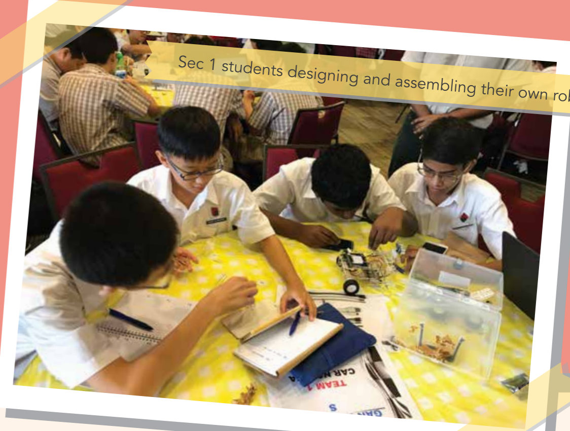
Sec 1 students designing and assembling their own robotic vehicle

Through altering the growth parameters and tapping on technology creatively, GESSians are to design an automated watering system and maximise plant growth for a vertical farm.