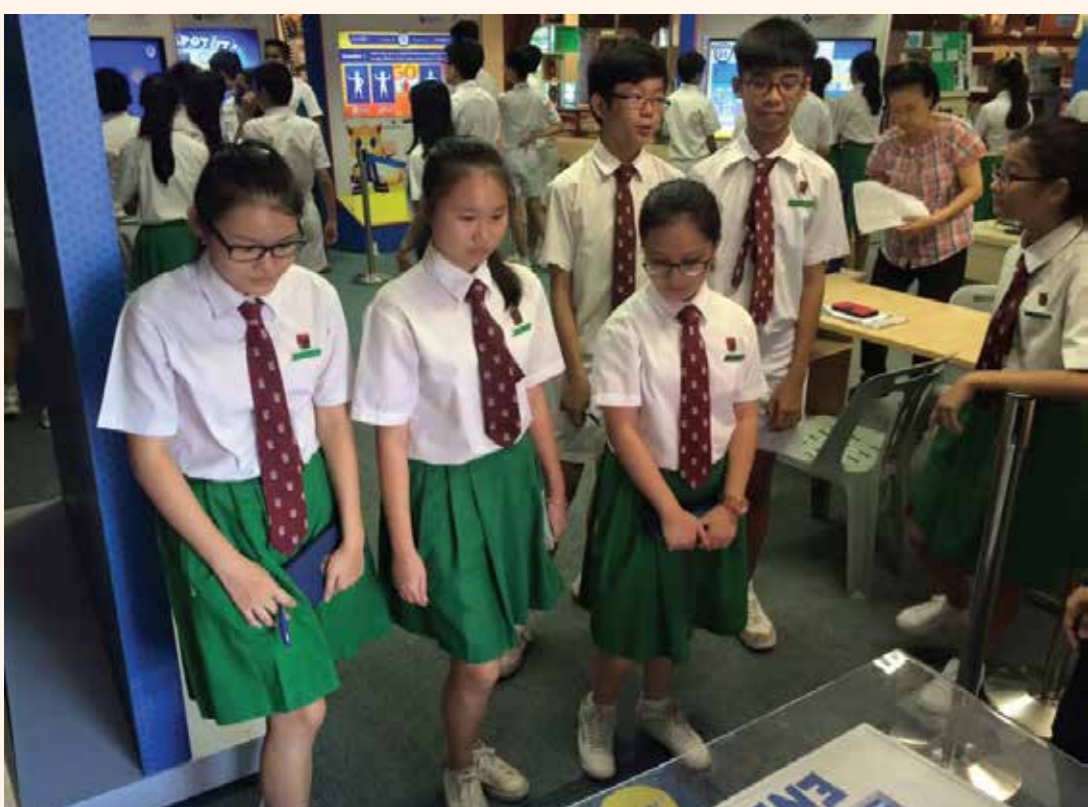
Students engaged at the interactive booths hosted by the Electricity Efficiency Centre