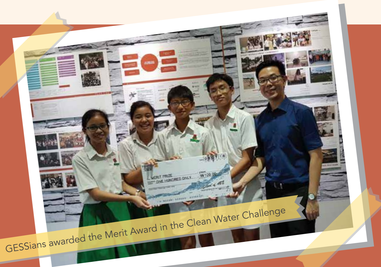
GESSians awarded the Merit Award in the Clean Water Challenge

The duo-tiered approach enables GESSians who have exhibited interest and aptitude in Tier 1 to proceed to Tier 2 where they get to further refine their designs and also stand to represent the school in various competitions.