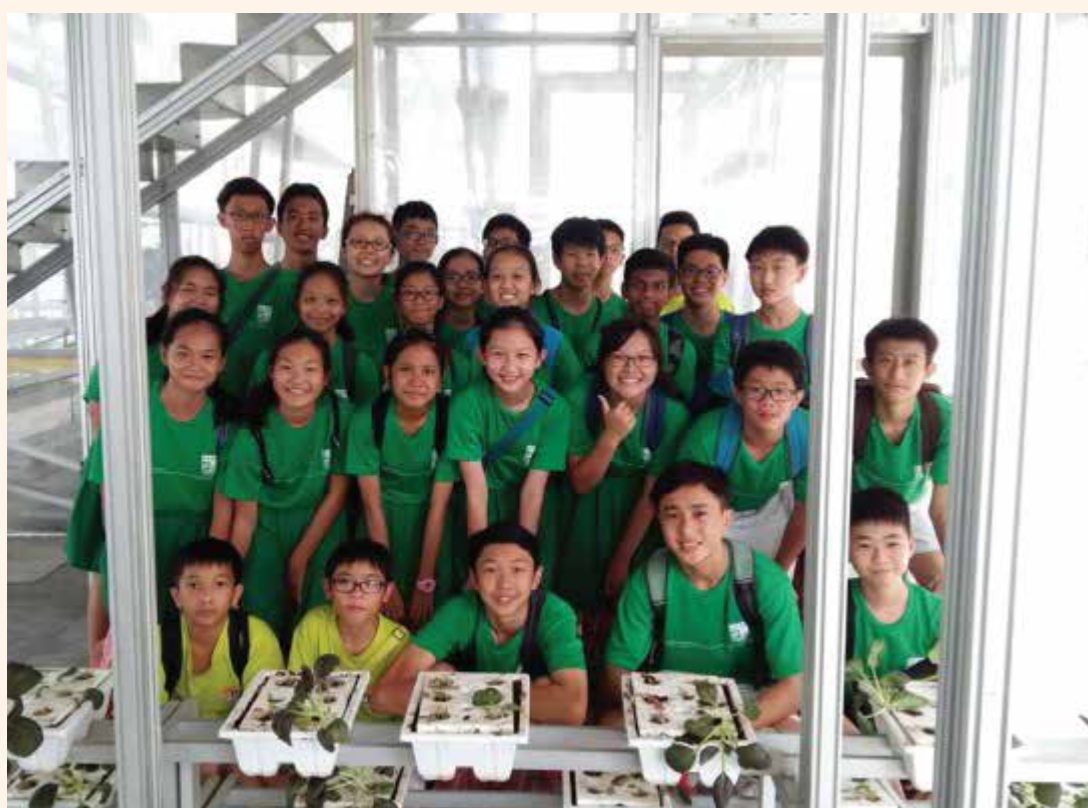
Understanding more on the State-of-the-Art technology in vertical farming