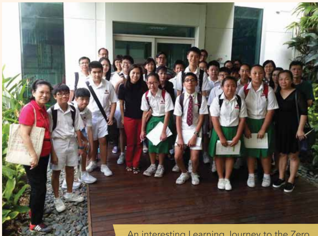
An interesting Learning Journey to the Zero Energy Building with the GESSians